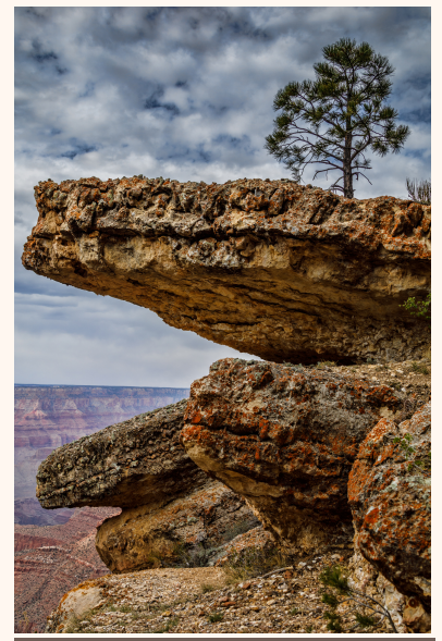
Psalms 96:1 Sing A New Song Unto The Lord

For all who are being led by the Spirit of God, these are sons of God. Romans 8:14